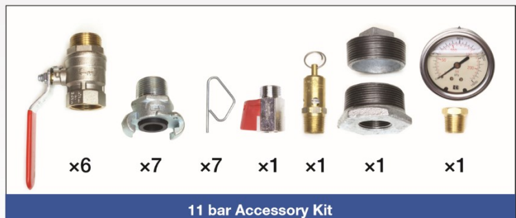
11 bar Accessory Kit

WH&S regulations stipulate that each manifold must be fitted with a safety valve, pressure gauge and drain valve. These items can be purchased in either of two accessory kits together with the most commonly used outlet valves and Minsup® claw couplings.